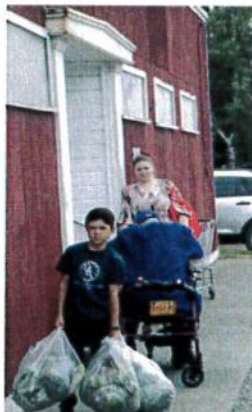
Delivering first weekly harvest to Palmer Food Bank [lettuce, kale]