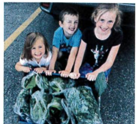
Displaying second weekly harvest