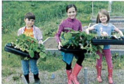
Delivering seedlings to garden