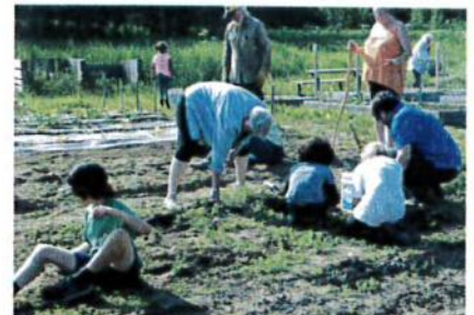
Weeding-garden prior to planting