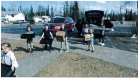
Delivering growing supplies to OLV

Our Lady of the Valley Catholic School [OLV] students and families have teamed with the Trinity Lutheran Church Community Garden project to supply the Palmer Food Bank with fresh produce. Each Wednesday OLV families weed, water and now harvest vegetables that are delivered to the food bank. The corporal works of mercy, "feed the hungry", takes on a whole new meaning for these willing Catholic school students as words are put into actions. Seeds of compassion have been planted.