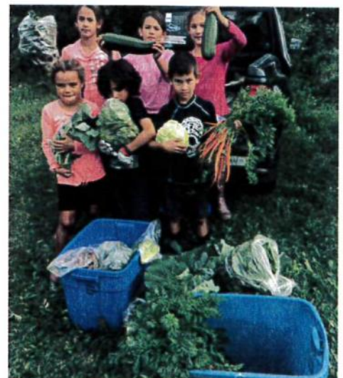
Harvest: preparing to deliver to Palmer Food Bank-start of August. [lettuce, kale, carrots, squash, beans, cabbage, tomatoes, broccoli- over 100 lbs.]

Trinity has received grants from Thrivent Financial Services for garden support after moose wiped out the garden at the end of last summer's growing season. Mat-Su Health Foundation provided funding for a fence to protect the crop.