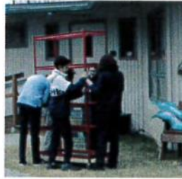
Assembling growing rack