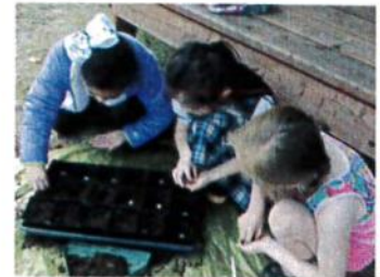
Planting squash seeds at OLV